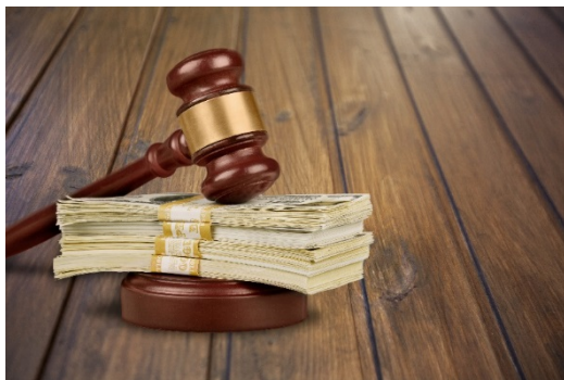
Legal and regulatory pressure