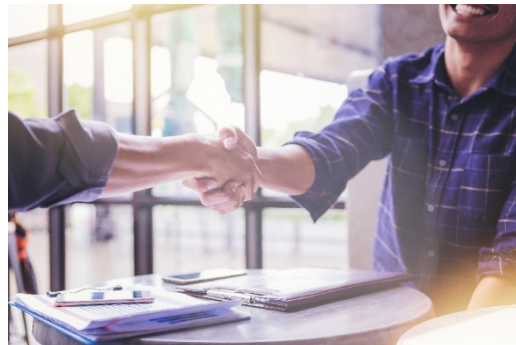
Reputation and competitive advantage