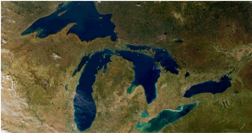
Photograph of the Great Lakes

In the Great Lakes region of North America, Blue Accounting is a groundbreaking initiative helping leaders to manage the world's largest freshwater ecosystem in a way that is more collaborative, effective and holistic than ever before. Blue Accounting facilitates collaboration among state, federal, provincial and private sector organizations to set regional shared goals and metrics, track progress toward those goals, and deliver relevant information to key audiences on an innovative online platform. Blue Accounting's mission is to improve decision making and increase efficiency of water management issues in the basin.