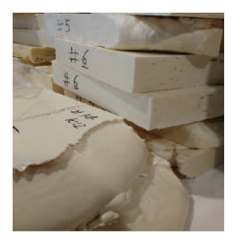
K12 Testing PU Samples produced with K12 innovative technology