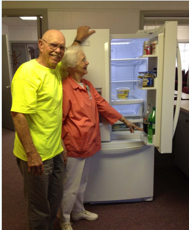
First United Methodist Church of Sweeny

(Refrigerator for Summertime Meal Program)