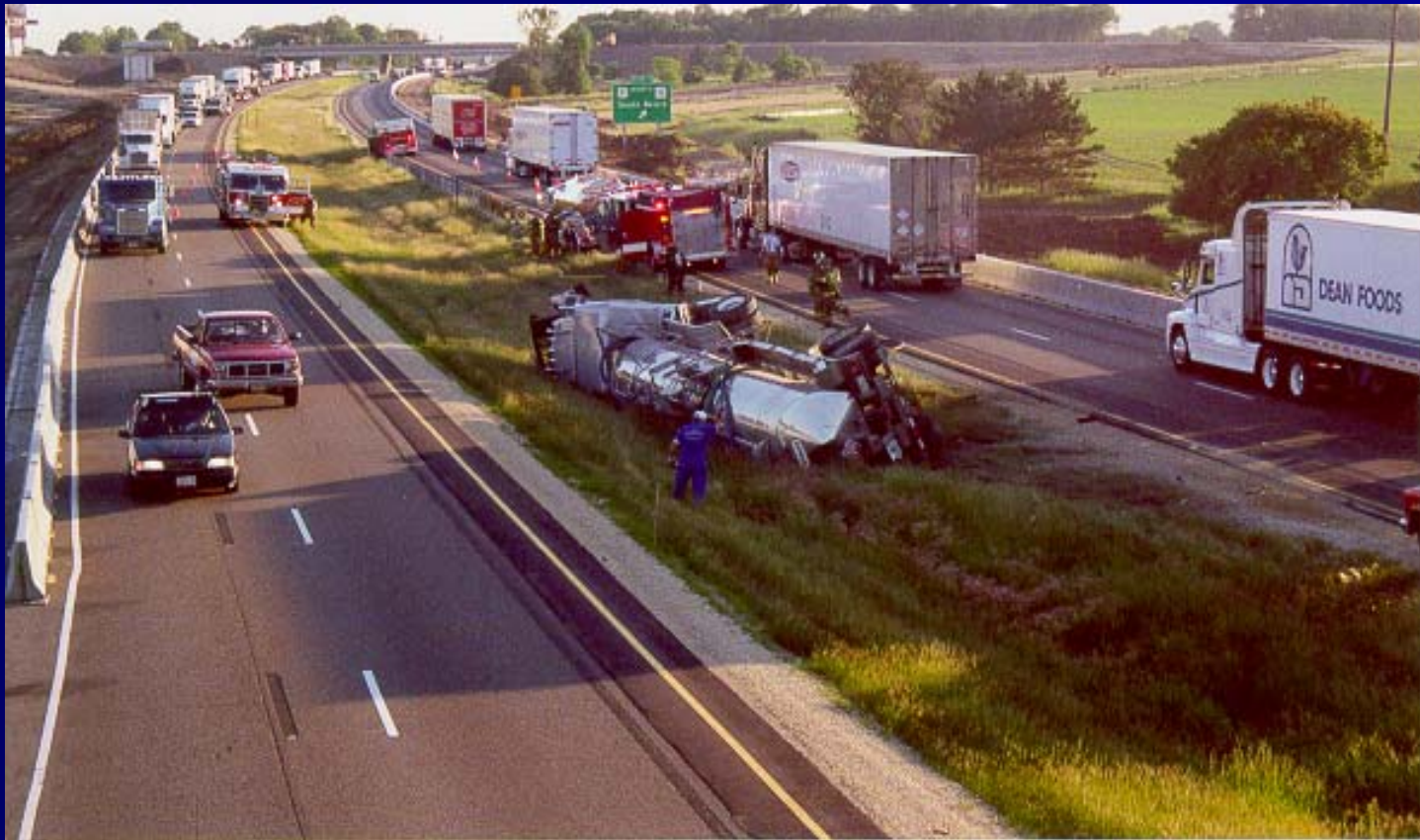
I-90 Wisconsin / Illinois Border