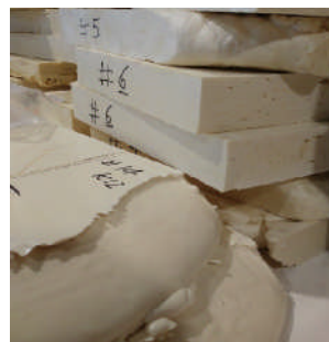
K12 Testing PU Samples produced with K12 innovative technology

Phase 2, realization of 2D and 3D molded prototypes: activities are on going at Afros pilot plant; 3D panels have been produced and tested; refrigerator door and mold designs are defined and under construction.